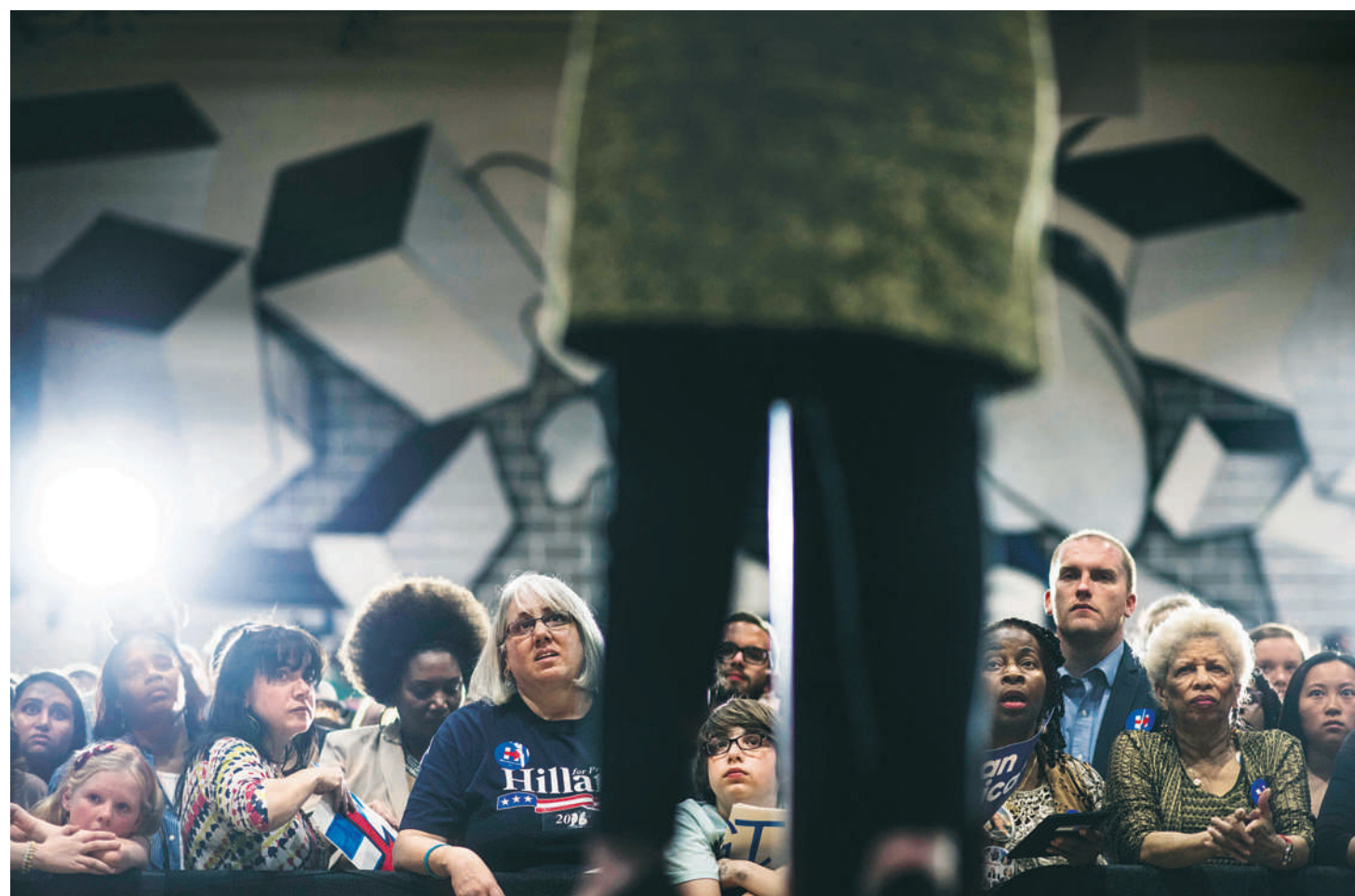
HILLARY CLINTON AT A MARCH 10 RALLY IN DURHAM, N.C.