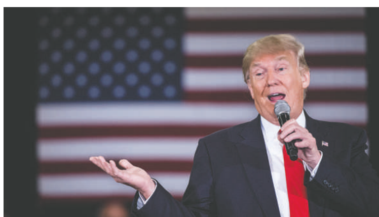
DONALD TRUMP AT A MARCH 30 EVENT IN APPLETON, WIS.

Candidate paints himself as a 'Lone Ranger' in controversial stances on economy and party